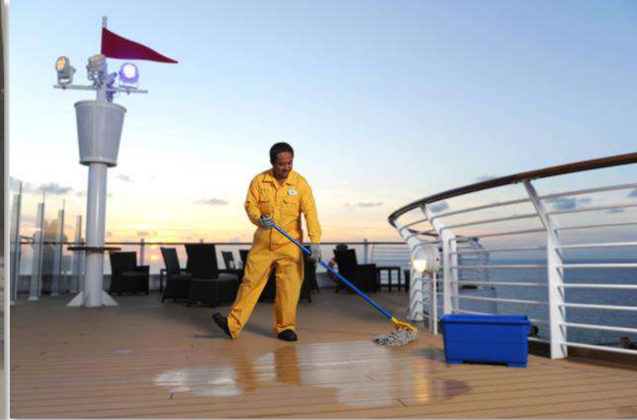
RATINGS -Watchkeeping Ratings certificates holders