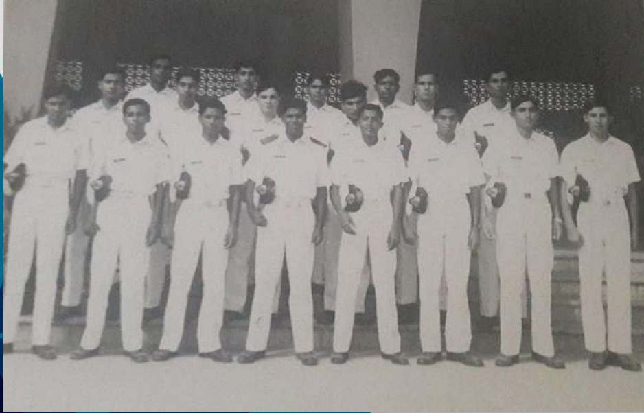
OFFICERS – Holders of certificates of competency (CoC)